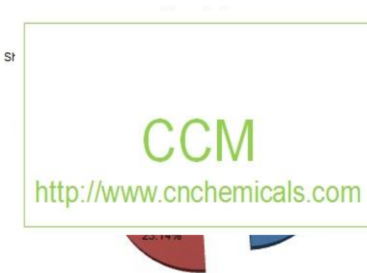
Figure 1.1.3-2 Output of azoxystrobin technical in China by region/province, 2015