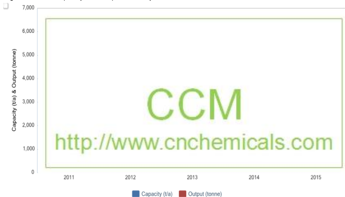
Figure 1.1.3-1 Capacity and output of azoxystrobin technical in China, 2011-2015